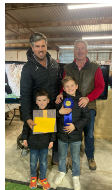
2023 Most Successful Exhibitor, Flock section - Piney Range-

~ $500 Cash ~ Most Successful Exhibitor in the Flock Section. Classes 5 & 10 excluded. Points will be awarded as follows:-1st-5, 2nd-4, 3rd-3, Champion-2, Reserve Champion-1