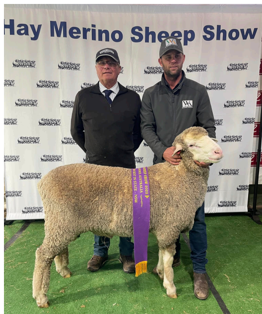
2023 Riverina Wool Australia Champion Hoggett Merino Ram Best of State (NSW) - WestRay Merinos

Champion ineligible to compete in single classes