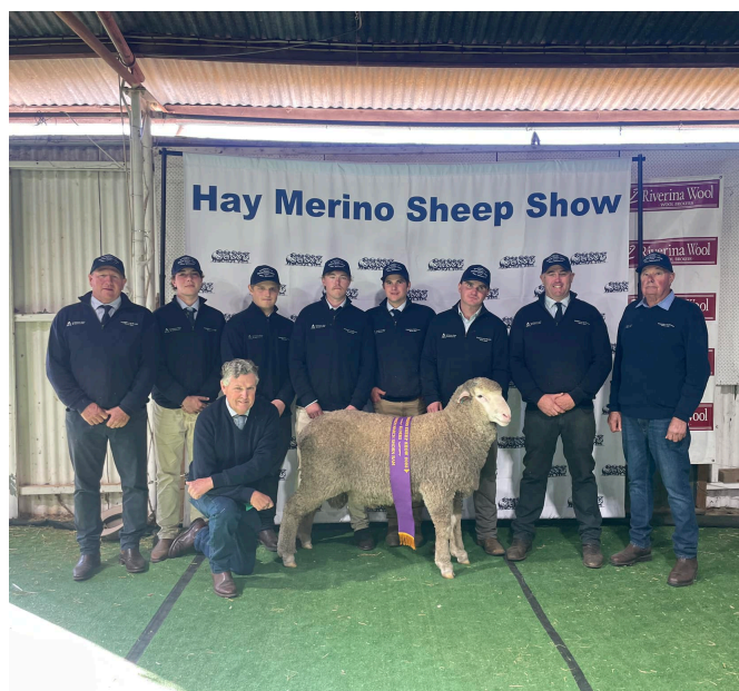
2023 Elders Champion March Shorn Ram - Poll Boonoke

Winners from Champ Med & Champ Strong Wool Ewe Wanganella Trophy $300 cash & Book Prize