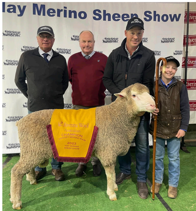
-Collinsville- 2023 Riverina Wool Australia Champion Hogget Merino Ram

Free Gate Entry sponsored by Bendigo Bank- Hay Branch